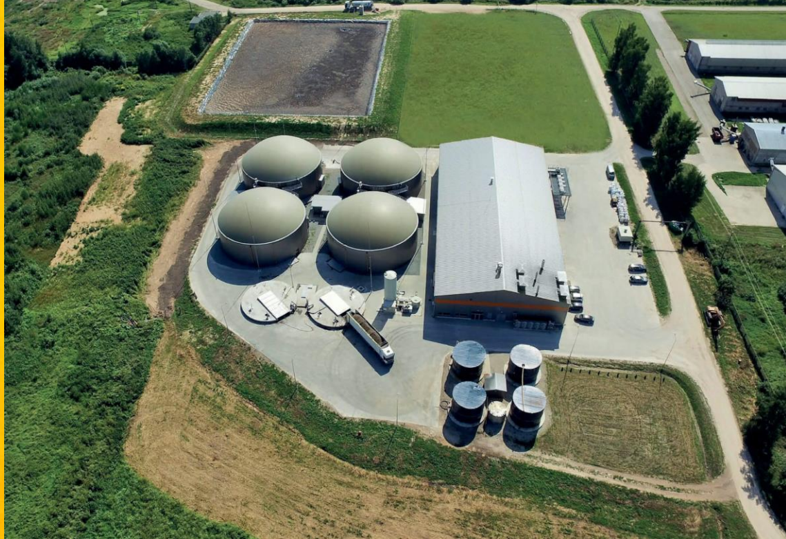
Biomethane 100 GWh yearly