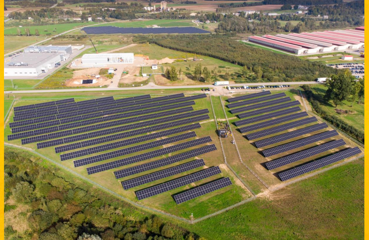
Sun energy 2,3 MW