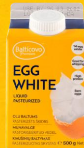
Liquid egg products